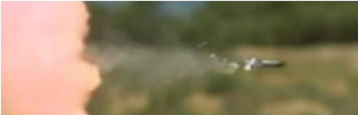
Paper patch "confetti".

A good PPB cartridge should chamber easily. There should be no need to force the cartridge into the barrel's chamber. After ignition, as the wrapped slick exits the muzzle, the patching paper should get sliced by the rifling and spin off as confetti.