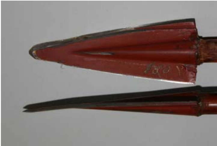
The two bent 160 grain Grizzly broadheads

*** Approximately 50% modified to COI Tanto tip.