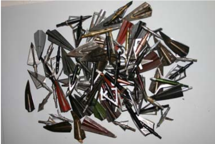
Some of the broadheads damaged during 2005 testing.